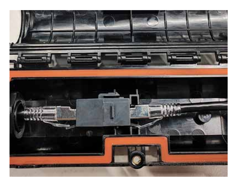
Twisted Pair Keystone