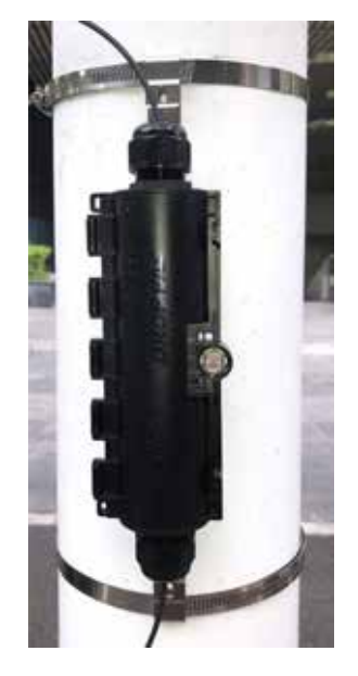
Pole Mount Installation