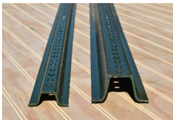
U-Channel Support Post