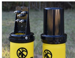
Mamba Round Cathodic, Twist Top

Standard Colors Follow APWA Uniform Color Code